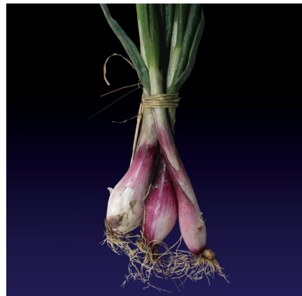
Cipuda scalognu - Spring onions