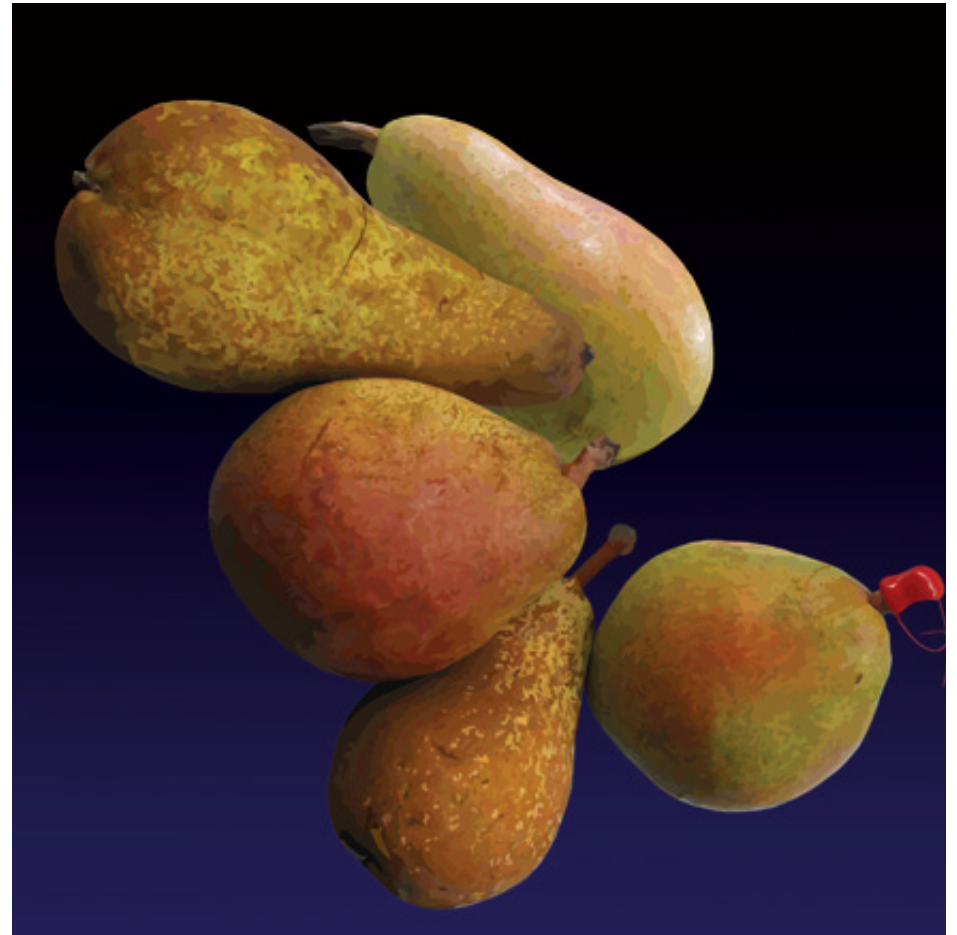
Pere - Pears