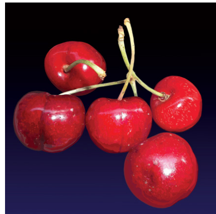
Cirasa - Cherries