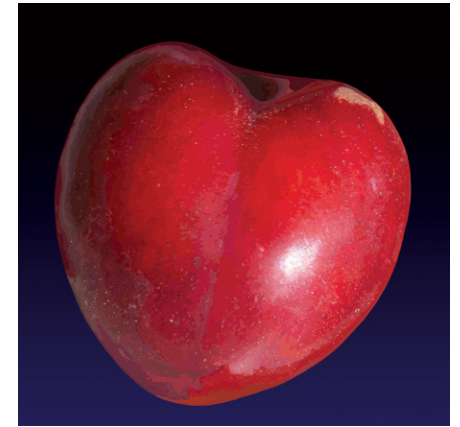
Prunu - Plum