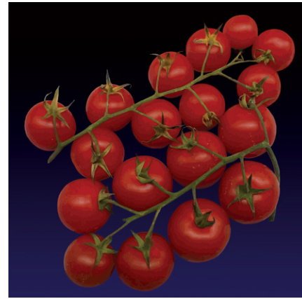
Pumaruricchiu - Cherry tomatoes