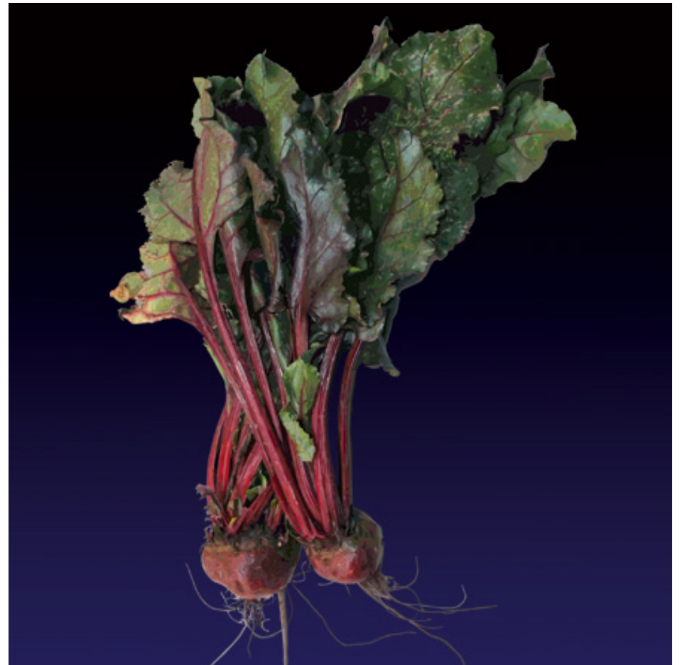
Rrapi rrussi - Beetroot