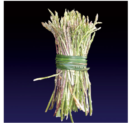
Sparaci - Asparagus