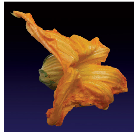
Ciuru di cucuzza - Pumpkin flower