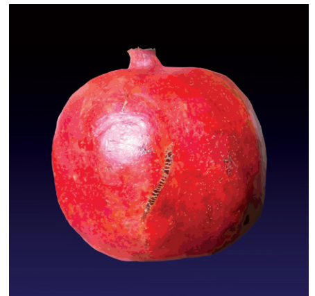
Granatu - Pomegranate