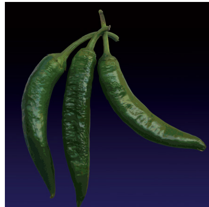
Pipareddi verdi - Green chilies