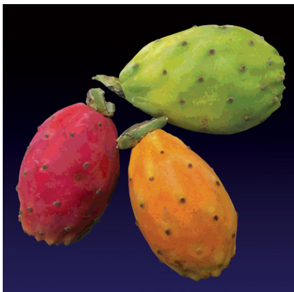
Ficu rinnia - Prickly pear