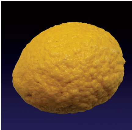
Pipittuni - Citron