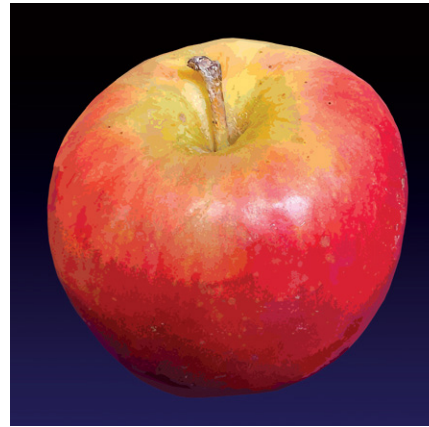
Pumu - Apple