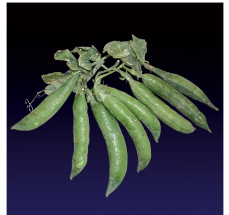
Piseddi - Peas