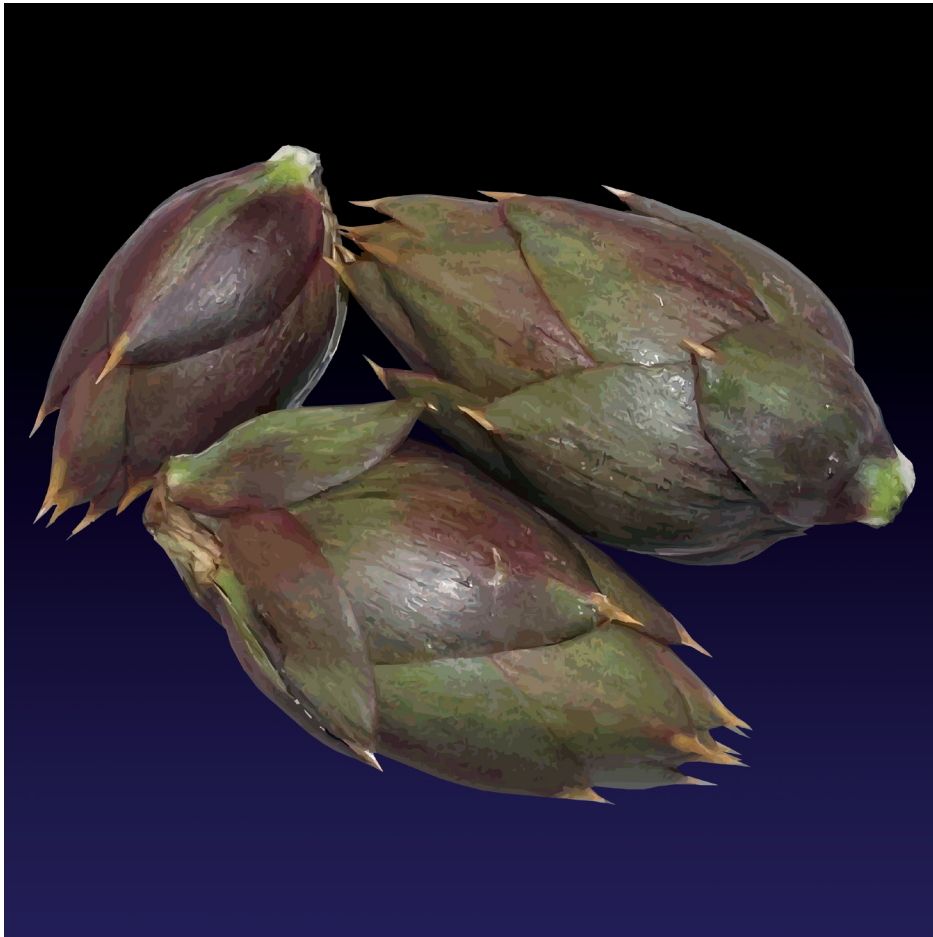
Cacocciuliddi - Baby artichokes