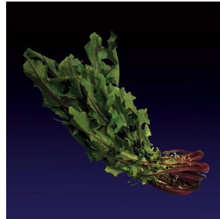
Cicuoria - Chicory