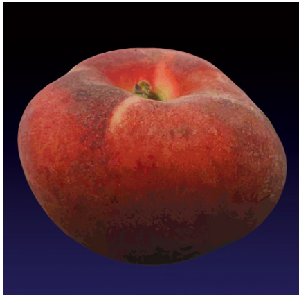
Persica - Peach