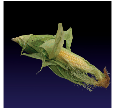
Furmintuni - Corn