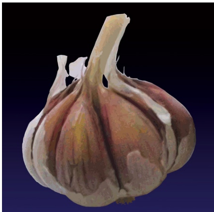
Agghia - Garlic