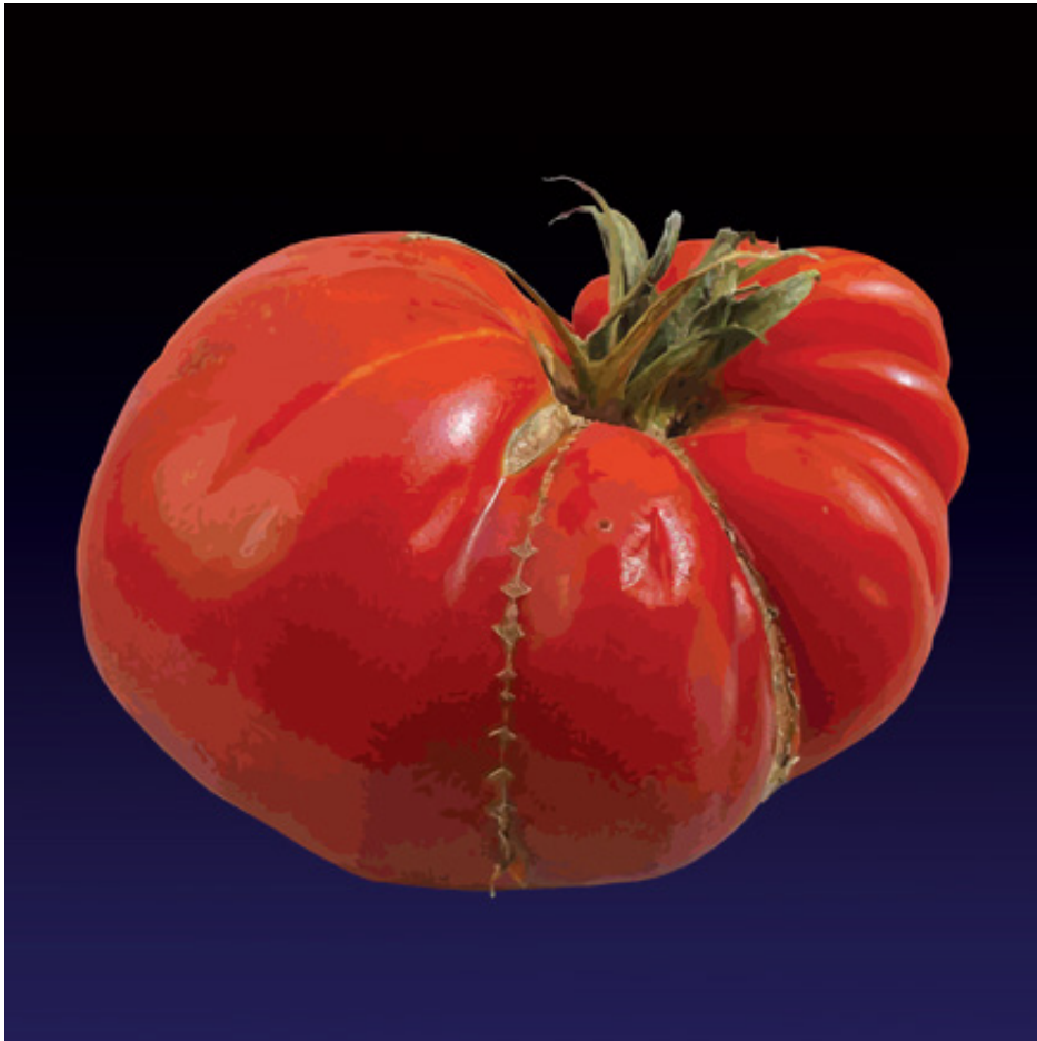
Pumadoru - Tomato