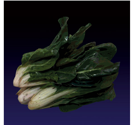
Giri - Beet