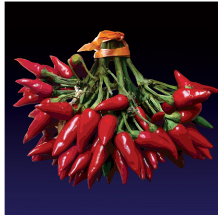
Pipareddi - Red chilies