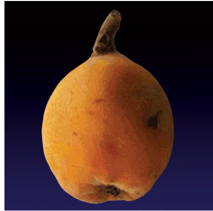
Nespulu - Loquat