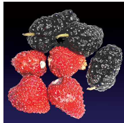
Fragulina e ceuse - Red berries