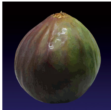
Ficu - Fig