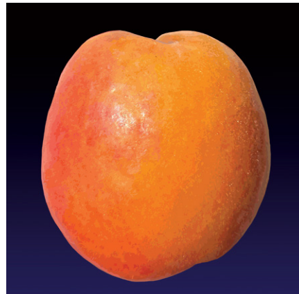
Piricoccu - Apricot