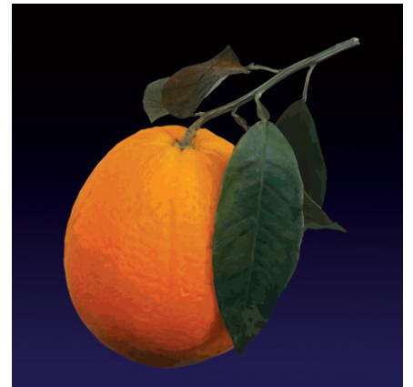
Taroccu - Blood orange